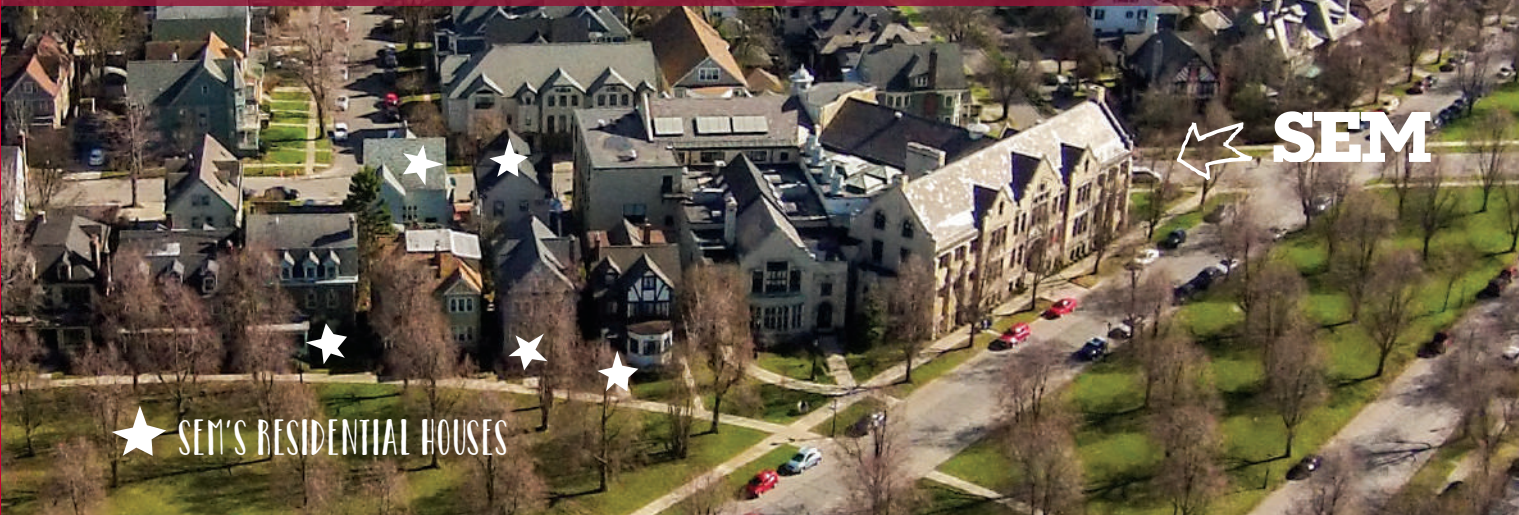
★ SEM'S RESIDENTIAL HOUSES

SEM is the only all-girls school in the region with a 5- and 7-day residential program. Renovated historic houses, all located beside the school and connected by the Magavern-Sutton Courtyard, are homes to girls from across the region and all parts of the world.