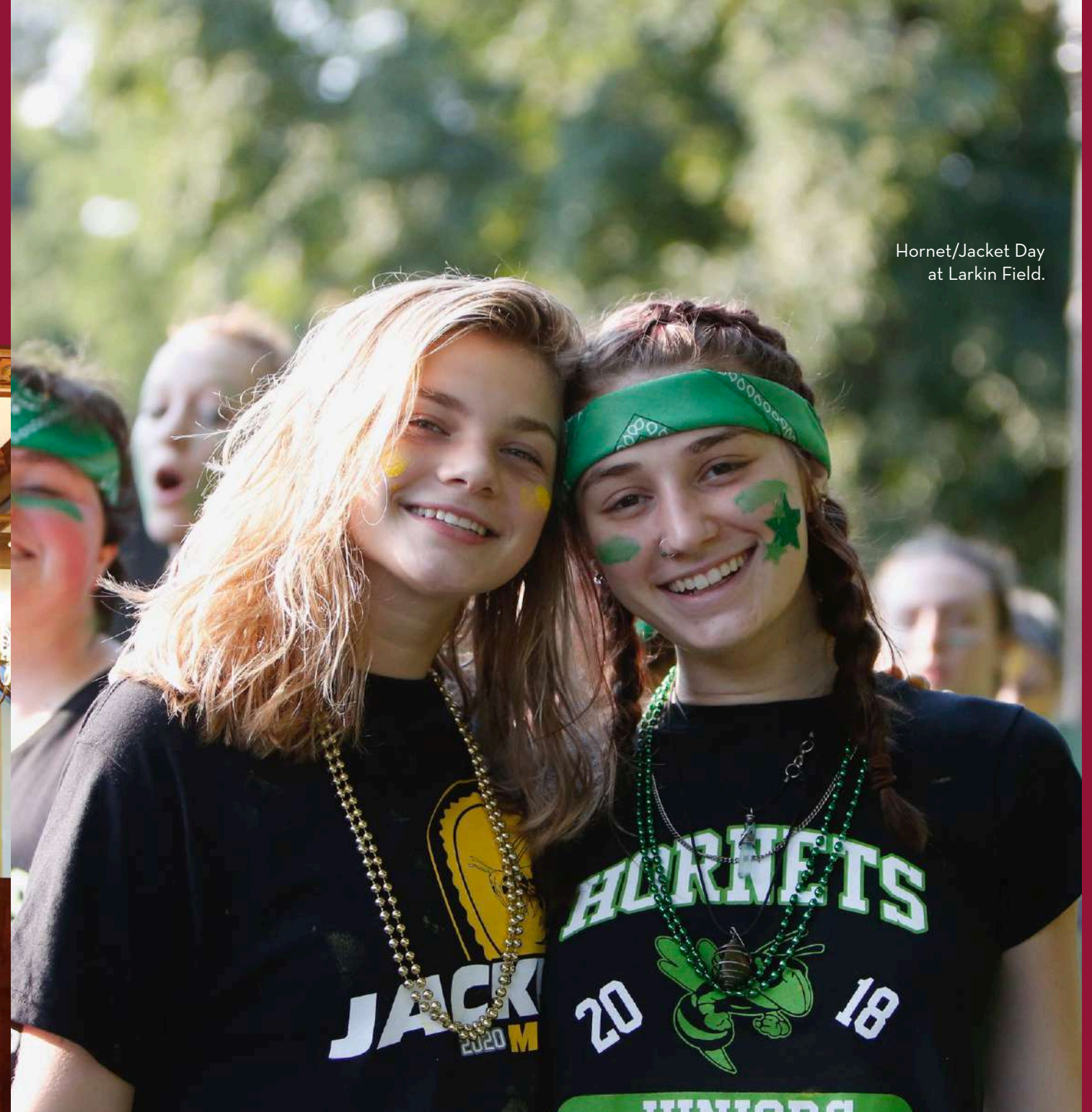
Hornet/Jacket Day at Larkin Field.