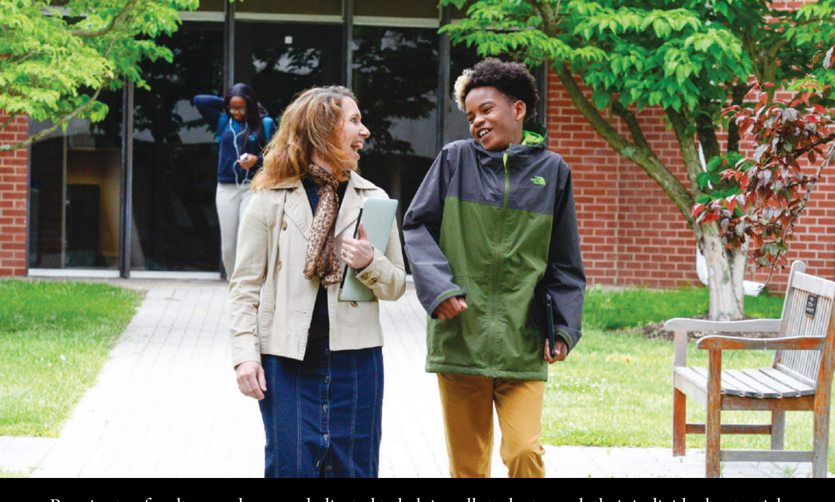
Pennington faculty members are dedicated to helping all students reach their individual potential.