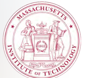
Massachusetts Institute of Technology